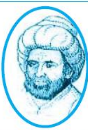
Muhammad ibn Musa al-Khwarizmi (A.D. 780 – 850)

A lemma is a proven statement used for proving another statement.