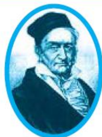
Carl Friedrich Gauss (1777 – 1855)

Carl Friedrich Gauss is often referred to as the 'Prince of Mathematicians' and is considered one of the three greatest mathematicians of all time, along with Archimedes and Newton. He has made fundamental contributions to both mathematics and science.