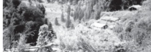
Figure 16.2 A view of a forest life

Do you think such use of forest resources would lead to the exhaustion of these resources? Do not forget that before the British came and took over most of our forest areas, people had been living in these forests for centuries. They had developed practices to ensure that the resources were used in a sustainable manner. After the British took control of the forests (which they exploited ruthlessly for their own purposes), these people were forced to depend on much smaller areas and forest resources started becoming over-exploited to some extent. The Forest Department in independent India took over from the British but local knowledge and local needs continued to be ignored in the management practices. Thus vast tracts of forests have been converted to monocultures of pine, teak or eucalyptus. In order to plant these trees, huge areas are first cleared of all vegetation. This destroys a large amount of biodiversity in the area. Not only this, the varied needs of the