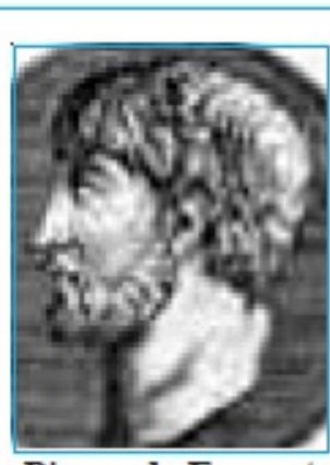
Pierre de Fermat (1601–1665)