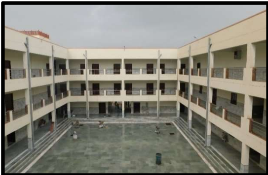
ADMINISTRATIVE BLOCK – INNER VIEW