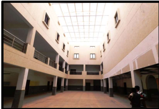
ACADEMIC BLOCK – INNER VIEW