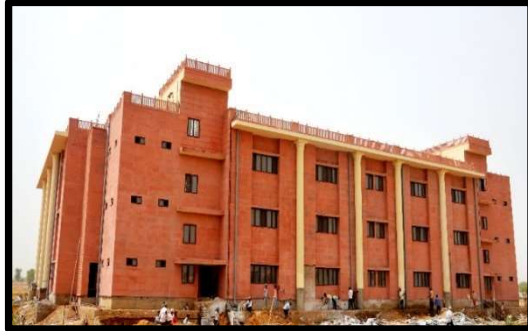
ADMINISTRATIVE CUM ACADEMIC