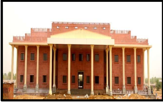
ADMINISTRATIVE CUM ACADEMIC BLOCK

9. Main Campus Facilities. A glimpse of facilities constructed at permanent site of school at Dorasar is depicted below: